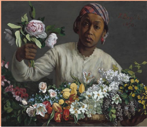
Frederic Bazille, French, 1841-1871, Young Woman with Peonies , spring 1870, oil on canvas, National Gallery of Art.

I became aware of FREDERIC BAZILLE on my first visit to the MUSEE D'ORSAY in the early 1990s. This exhibition at the freshly renovated NATIONAL GALLERY OF ART www.nga.gov brings together 74 paintings from this artist who was a part of an artistic circle in PARIS that included CLAUDE MONET, ALFRED SISLEY and EMIL ZOLA . His paintings were inspired by scenes of contemporary life, his being cut short at the age of 29 in battle during the Franco-Prussian War. You can also enjoy the other rich collections and exhibits at the NATIONAL GALLERY as well as countless other treasures on the National Mall. COST: SPECIAL SUMMER PRICE OF $60. Take off an additional 10% if you also join us on Wednesday, July 12 and Wednesday, August 16 for our summer day trips to NEW YORK CITY . That would be $162 for three trips!