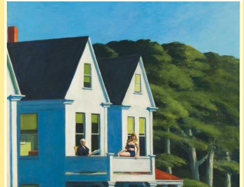
Edward Hopper (1882-1967), Second Story Sunlight, 1960. Oil on canvas. Whitney Museum of American Art, New York; purchase, with funds from the Friends of the Whitney Museum of American Art.

Spend the day on your own or join us for a visit to the new Renzo Piano-designed WHITNEY MUSEUM which has opened in the meat-packing district of NEW YORK CITY . You can also walk on the fabulous HIGH LINE nearby, or browse in galleries in CHELSEA . COST: $65 . Timed tickets to the Whitney are additional.